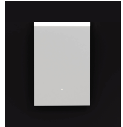
L10 Style Frost Pattern

*Note: Anti-fog adders are on their own 120V power source and cannot be attached to a dimmer.