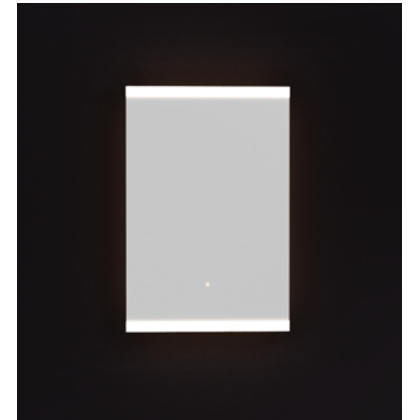
L06 Style Frost Pattern

*Note: Anti-fog adders are on their own 120V power source and cannot be attached to a dimmer.